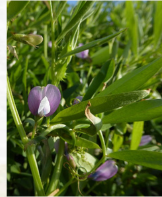
Bithynian Vetch