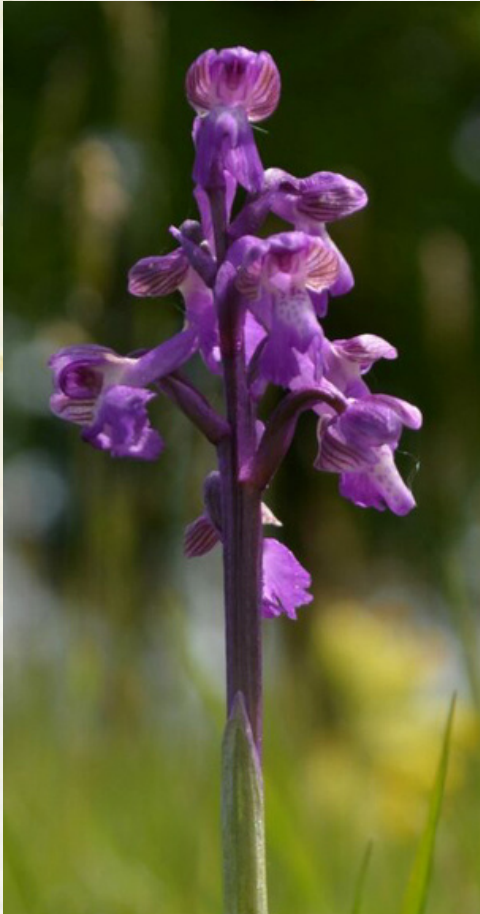
Green Winged Orchid

Can you spot all of these wild flowers on your walk?